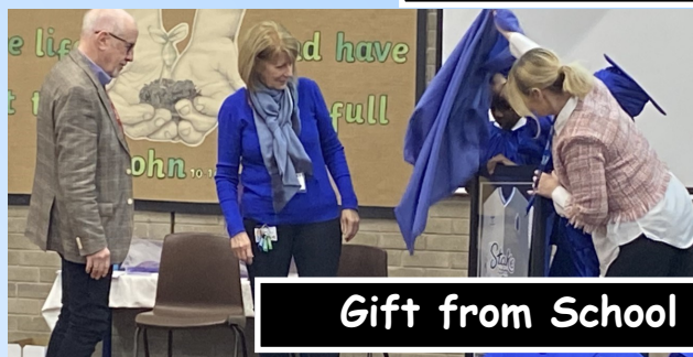
Gift from School