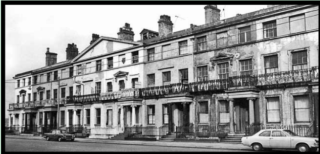
Falkner Square in 1974